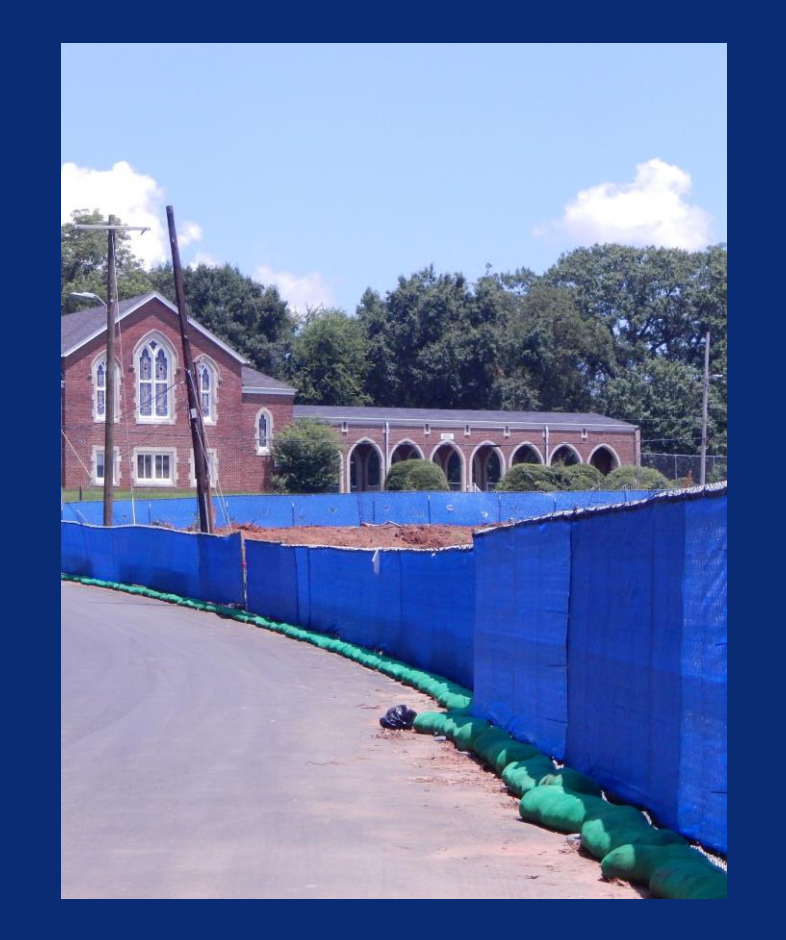
Wind Screen & Erosion Control Installation at South Alvarado